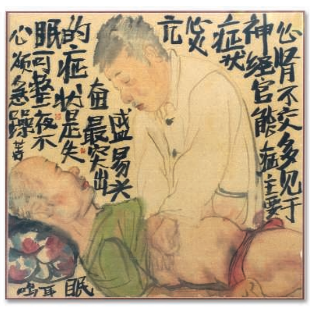
Locus of pain. In traditional Chinese medicine, mental illness is often attributed to maladies of the heart.

the handover. In November 1998, a woman sealed herself inside her bedroom and lit a charcoal fire on a grill, poisoning herself with carbon monoxide. By January 2000, 160 Hong Kong residents had killed themselves this way. Lee's team reviewed coroners' records for all 160 and interviewed 25 people who survived attempted charcoal suicides. They also interviewed families and survivors of other suicide methods. People who killed themselves by charcoal fumes had one thing in common that the others did not: serious debt.